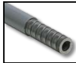
Coil Wound Housing (CW)