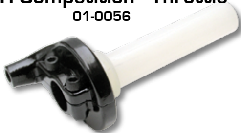
CR Competition™ Throttle 01-0056