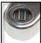
Roller bearing in clutch pivot