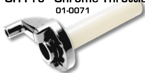
CR Pro™ Chrome Throttle 01-0071