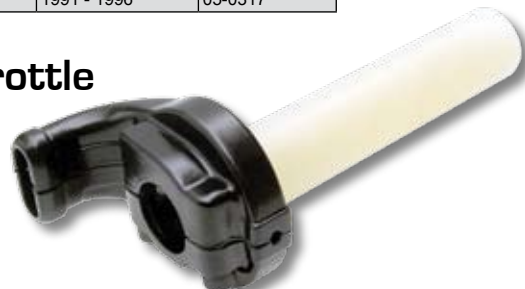
Straight Push-Pull Throttle 01-0073