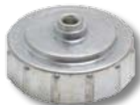
01-0023 Mikuni Cap