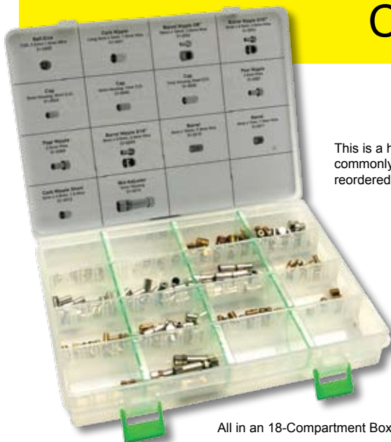
All in an 18-Compartment Box with label

This is a handy shop kit with the 14 of the most commonly used cable fittings. All fittings can be reordered as individual packets as listed below.