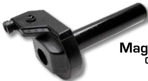
Magura® 314 01-0060