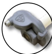
Vortex™ Throttle 01-0054

Included: Rubber Mud Cover for Vortex Throttle