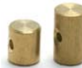
01-0011 (F) Barrel 01-0010 (F) Barrel