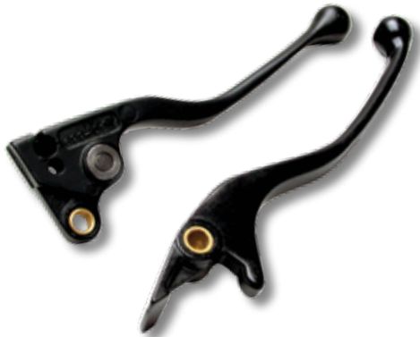
OE Style Offroad