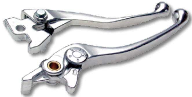
OE Style Street