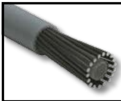
Longitudinally Wound Housing (LW)