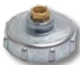
01-0022 Keihin Cap