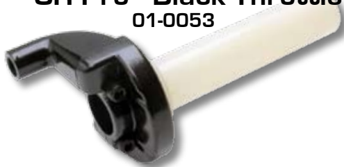
CR Pro™ Black Throttle 01-0053