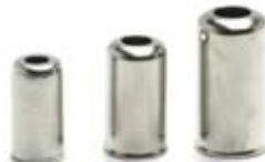
01-0004 (D) Cap Housing End 01-0005 (D) Cap Housing End 01-0006 (D) Cap Housing End