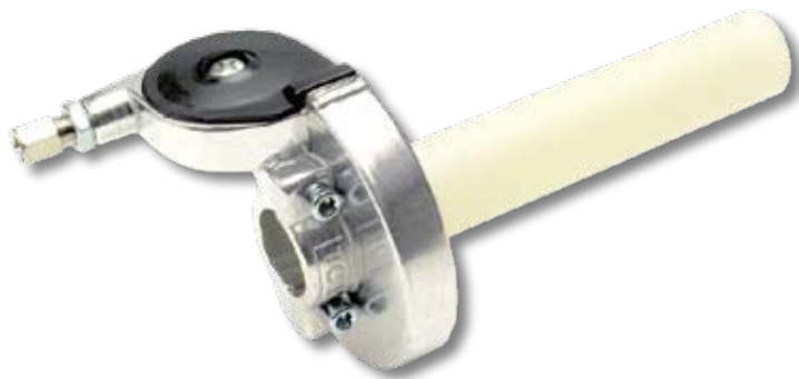
Turbo™ Throttle 01-0057